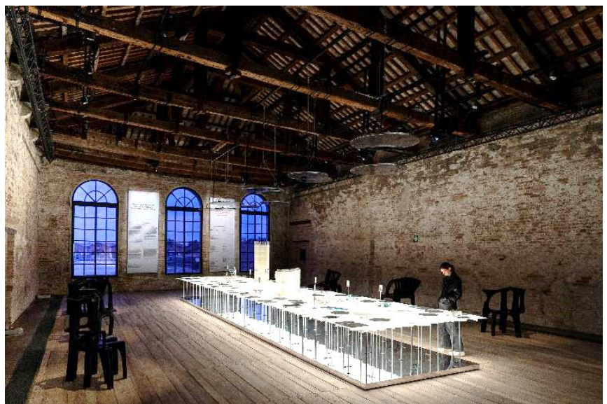
2025 Singapore Pavilion by Singapore University of Technology and Design