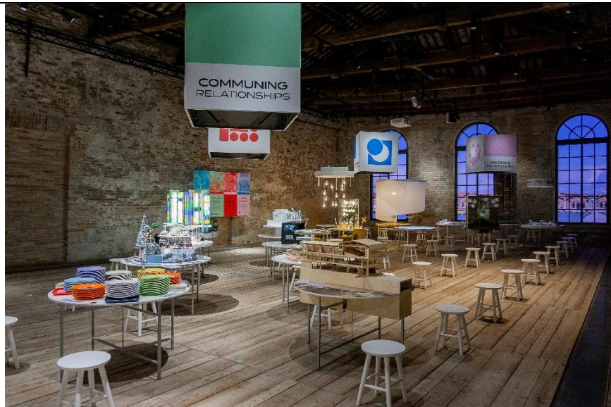
2021 Singapore Pavilion by National University of Singapore