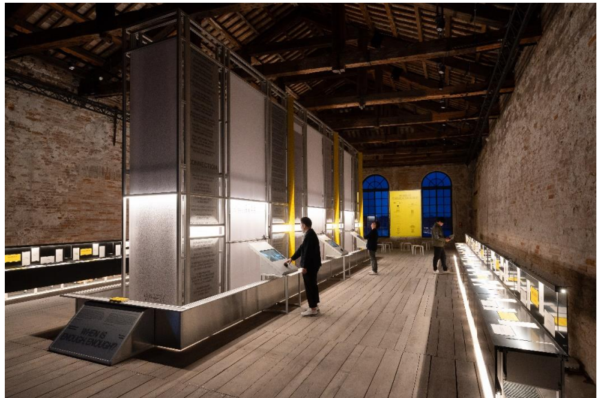
2023 Singapore Pavilion by Singapore Institute of Architects